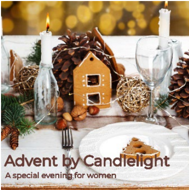
Advent by Candlelight A special evening for women