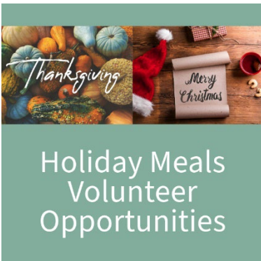
Holiday Meals Volunteer Opportunities

For our Thanksgiving meal this year, Outreach on 7 th (OO7) is expecting approximately 80+ people from our Lunch Program and the Essentials Pantry. We need volunteers to cook and serve on Thanksgiving Day. We will also need people to pick up a turkey from us and cook/slice it and return it to the church. Then, we will need volunteers to help prepare and serve the Christmas meal on Christmas Day. Scan the QR code to sign up for the Thanksgiving meal and/or the Christmas meal.