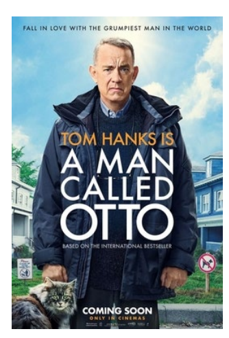
Monday, January 23—"A Man Called Otto"

Join us for our final movie this Monday at MJR Troy Movie Theater at Maple and Livernois Roads at 7:00 p.m. Tickets are only $8.50. If you have any questions, contact the church office at 248.541.4100 or office@rofum.org. The theater we will be in is reserved just for Royal Oak First.